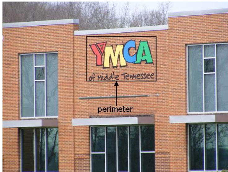
Example of copy without distinct background