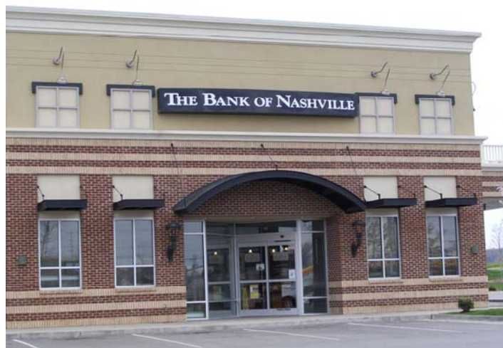
Example of copy and background as integrated unit